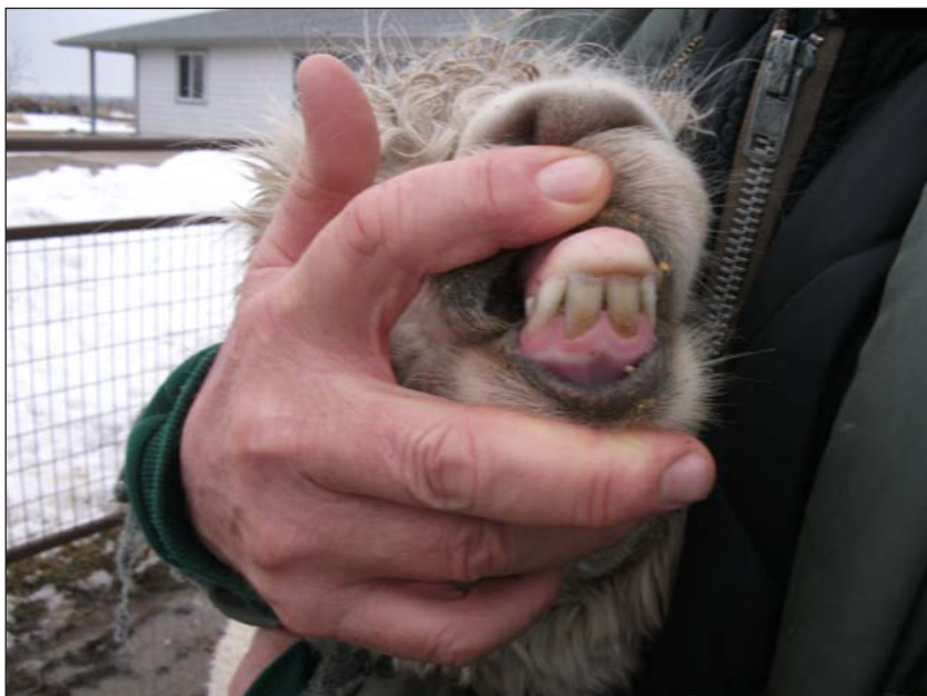
Correct alpaca bite.

Llama and alpaca producers will also need to undertake dental care. Of particular concern are the fighting teeth, which generally erupt at two and a half years of age. Fighting teeth rarely need