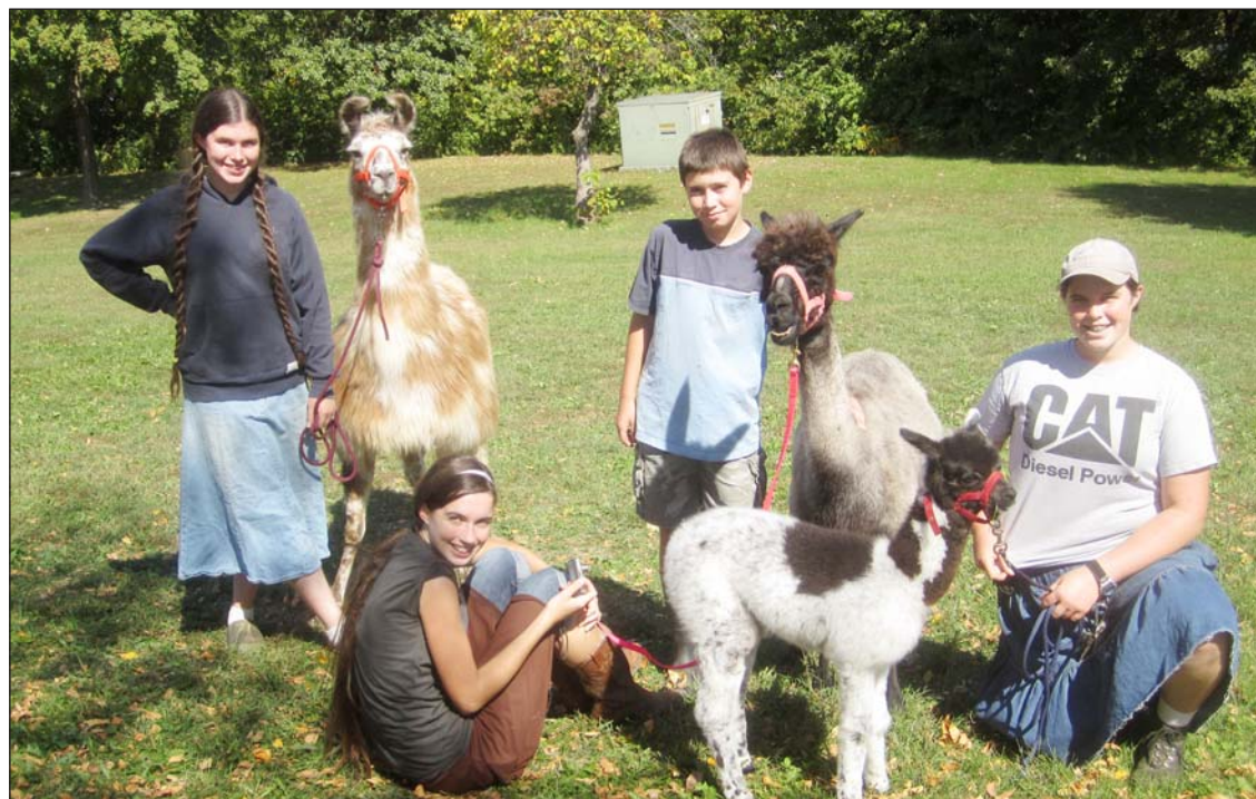
Social animals.

Llamas or alpacas can be a good addition to a farm or ranch—an alternative livestock enterprise on marginal pastureland that fits well into a diversified farming operation. This publication discusses considerations for raising llamas and alpacas, including regulations, marketing, nutrition, care, reproduction, and handling.