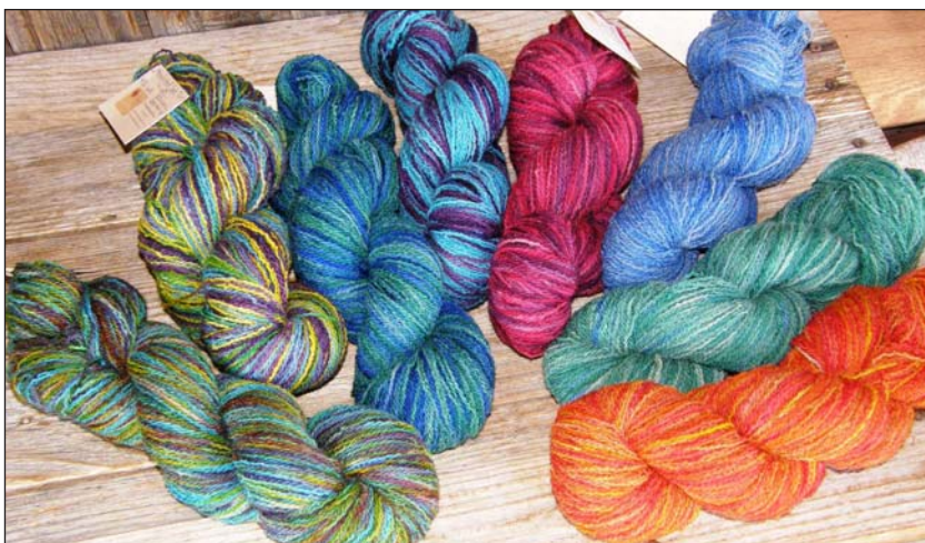
Handpainted Sock Yarn, 80 percent alpaca, 20 percent merino blend.

Llamas are usually shorn annually and have a double-hair coat consisting of a fine wool fiber intermingled with stiff guard hairs. The guard hairs can be left in when making rugs and ropes. But before spinners and weavers can use the 4- to 7-inch-long