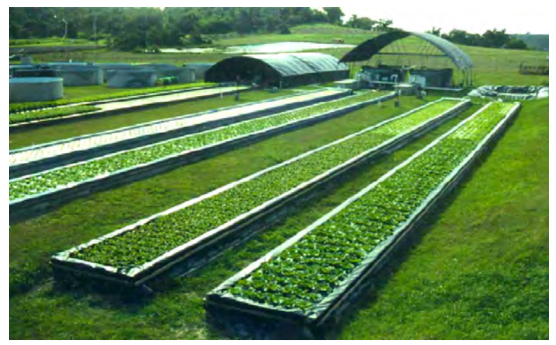
UVI aquaponic system.

Tilapia are stocked at a rate of 77 fish per cubic meter for Nile tilapia, or 154 fish per cubic meter for red tilapia, and cultured for