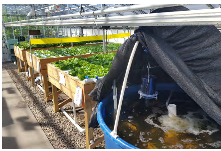
Aquaponic system.

A small-scale aquaponic system can augment a home garden and provide a healthy source of food. If a production-scale operation is not what you're are looking for, but you envision a small project for your homestead, backyard, or small farm, see Principles of Small-Scale Aqua ponics from the Southern Regional Aquaculture Center, at https://srac-aquaponics.tamu. edu/viewFactSheets.