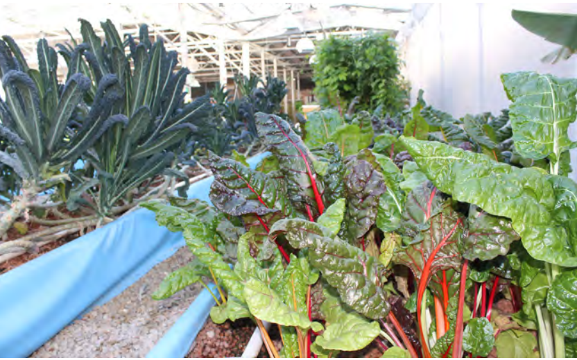
Flood and drain.

2. Flood and drain uses of a substrate of pea gravel, perlite, or expanded clay as a plant growth medium. A biofilter is not necessary in this system because bacteria colonize the internal structures and pipe in the system, providing essential nitrification of fish wastes for plant uptake. Water constantly flows through the system on a 20- to 30-minute cycle to provide periodic exposure of the plant roots to water and air. Flood and drain systems are particularly suited for heavy-fruiting plants such as peppers or tomatoes.