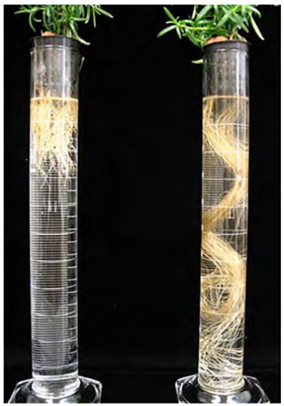
Rosemary roots grown hydroponically (left) and aquaponically (right).

Just as adding fish to plants increases efficiencies, adding plants to land-based recirculation aquaculture has its own benefits. Recirculation aquaculture requires that wastewater be treated