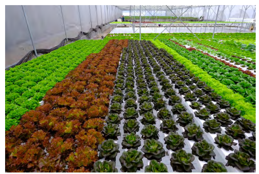
Nutrient film technique.

1. Nutrient film technique (NFT) allows the plant roots to absorb nutrients from a <sup>1</sup>/<sub>2</sub>-inch film of water with high oxygen exposure. A small amount of water enters one end of a channel or gutter and flows by gravity to the other end, where it drains into a common collection area. Because of the high potential surface area, this method allows for greater plant production with less water.