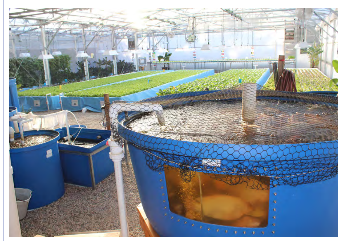
Aquaponic system.

Aquaponics is a bio-integrated system that links recirculating aquaculture with hydroponic vegetable, flower, and/or herb production. Advances by researchers and growers alike have turned aquaponics into a working model of sustainable food production. This publication introduces aquaponic systems, discusses economics and getting started, and includes an extensive list of resources that point the reader to print and online educational materials for further technical assistance.