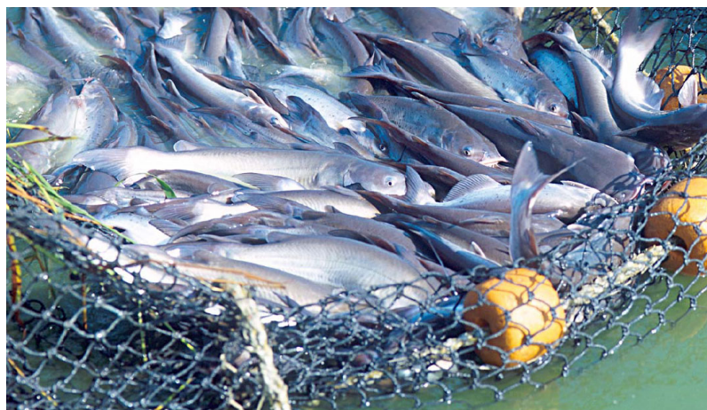
Market-size catfish.

Aquaculture is the cultivation of fish and aquatic animals and plants. Closed aquaculture systems need pumps and aerators to provide oxygen, to move water into and through the system, and to purify the water. Solar-generated electric power, known as photovoltaics (PV), can be used to meet the power needs of an aquaculture operation.