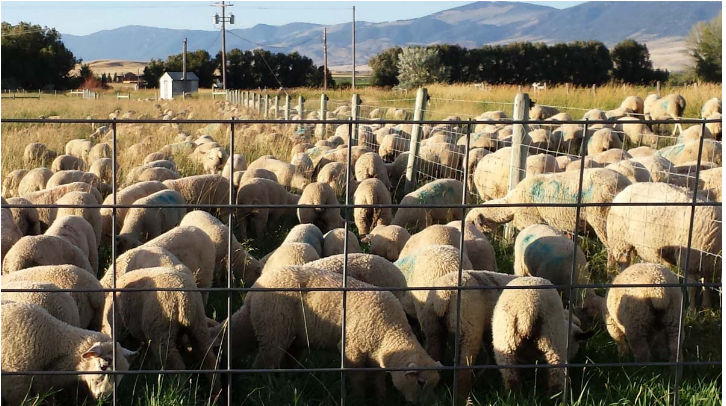
Fence-line weaning begun with ewes on the right and lambs on the left. Note that all heads are down, grazing. After 48 hours, the lambs were gently moved away. Not one bleat and little stress.