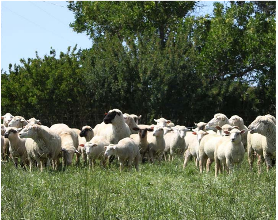
Ready to move. Six to eight inches of residual.