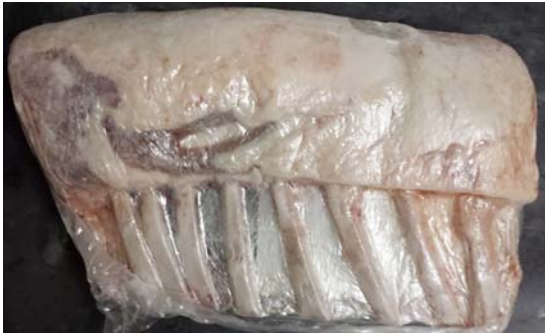
A rack with an undesirable tear in the finish, or fat covering the meat.

butcher and more cost to you in terms of unnecessary feed. One of the best ways to enhance relations with your butcher is to present him with a nicely finished animal. He enjoys working with a lamb that exhibits quality throughout.