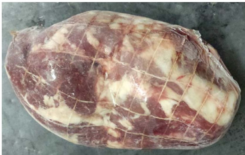
A nicely processed boneless half-shoulder roast, double-wrapped in plastic wrap and then Cryopak. Note the tight seal and the absence of air pockets.

Beyond that, there are two methods: vacuum pack and Cryopak. Both have their advantages