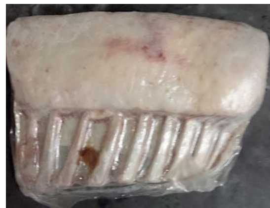
A nicely prepared rack of lamb.

Conversely, racks with too much finish must be trimmed, resulting in more labor from the