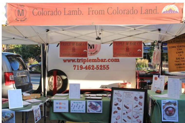
A well-designed market booth draws the customer's attention to the entrepreneur.

interwoven into the twigs. It was a great hit with children and allowed us to talk to their parents about our farm and our lamb.