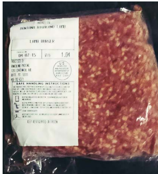
A package of lamb burger displaying about 85/15 meat-to-fat ratio and attractive color. Perception and appearance drive customer sales.

Another example in which the skill of the butcher translates to economic gain for the lamb producer is in processing the trim into grind. Trim is the meat trimmings removed from all of the primary cuts that are not suitable to be included therein. Any excess fat needs to be removed from the trim in order to make a quality grind. This excess fat is a small but notable amount. Too much fat will produce ground lamb that will likely be rejected by the consumer, especially when it is packaged in clear packaging. It is best to shoot for a ground product that is 85% meat and 15% fat. Ideally, the trim should be ground at 32°F to 34°F in order to be packaged as a crisp, engaging product. Additionally, grind must be frozen quickly. Anything that slows the freezing process (excessive stacking of the packages in freezer, or too-slow freezing, for example) can result in discoloration of the meat. Ground lamb that is attractively presented in its package is one of the best-selling of all lamb cuts.