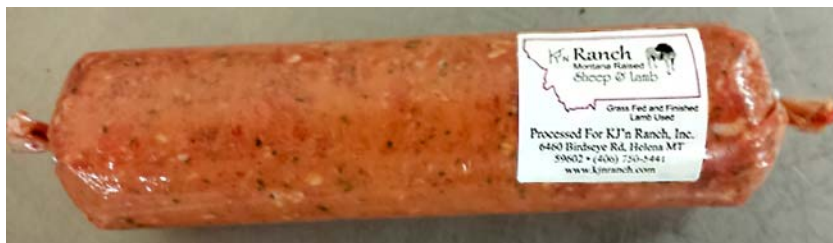
This lamb herb sausage by KJ'n Ranch in Helena, Montana, is packed in a roll, or chub package.

your meat, keep in mind the three objectives of packaging: presentation, functional integrity of the package, and retailer acceptance.