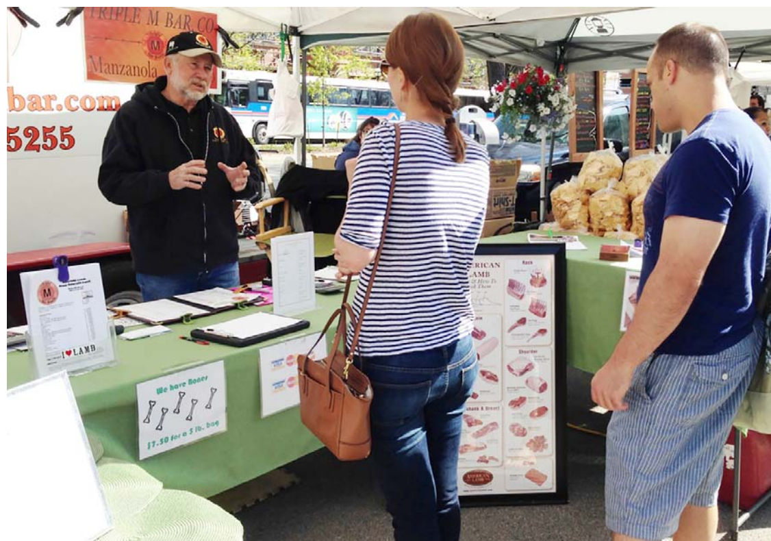
Direct marketing offers economic opportunity that cannot be found in the sale barn.

This publication describes an alternative to marketing lamb other than as a commodity—and capturing the economic benefits. Successful marketing techniques are described, beginning with the finished lamb and continuing through the processing, pricing, and sale of whole and boxed lamb to today's eager local foods customer.