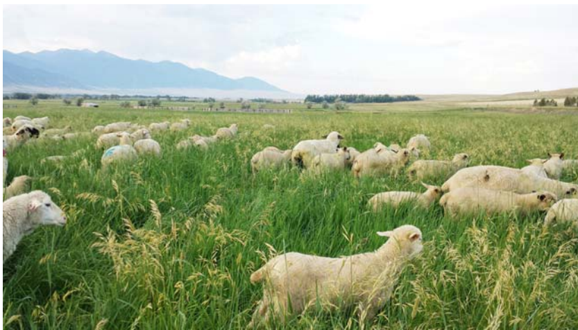
Today's food-conscious customer wishes to tie her table to your farm. Encourage it!

Once you have a potential customer's attention, differentiate your lamb from that of your competitors. Start big in scope and narrow down. It's easy for a customer to grasp that lamb produced in Australia and shipped on a boat 11,000 miles is not going to be as fresh as your lamb that is raised locally. Describe how your lambs freely roam on green pasture for most of their life, and this, along with the genetics in your flock, is what produces such mild-tasting meat. Tell how you finish your lambs, letting customers know that you have a proven system for producing that delicious product they just sampled. Mention that your lamb is antibiotic, hormone, and GMO-free. If it is certified organic, stress that. Detail how you go through all of your lambs weekly and select out those that are finished (see the ATTRA video Putting a Hand on Them – How to Tell When Your Lamb is Finished ) and ready to be processed. Reinforce that it is just not possible for a big feedlot to do that and explain that while these efforts increase the price somewhat, it is worth it. Then encourage them to buy your lamb and experience the difference in quality themselves.