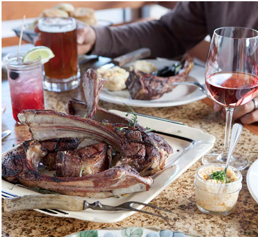
Restaurants represent a valuable part of a lamb entrepreneur's customer base, due to the large volume of product they buy.

serve racks, which is standard menu fare. Unfortunately, there are only two racks per lamb and they only comprise one-tenth of the total carcass. It is to your advantage to use those high-demand cuts as encouragement for a chef to utilize other cuts in his main menu, for specials or for entrees. Many chefs realize that you have to sell the whole animal in order to stay in business. Excellent chefs also enjoy the challenge of making a superlative meal out of cuts that are not in high demand such as shoulder roasts, shanks, or riblets. Find those chefs and keep them. It is always better to build strong and friendly relationships with a core of chefs that you can realistically satisfy than to spread yourself thin over many and supply no one very well.