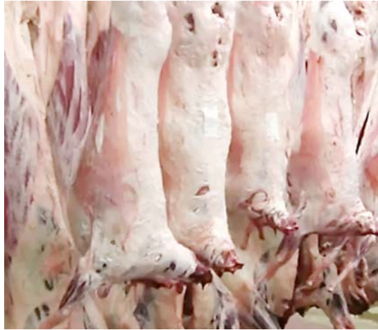
A group of lamb carcasses being dry aged. Dry aging tenderizes and intensifies the flavor of the lamb.

I n general, dry aging lamb for seven days optimizes tenderness and flavor while minimizing weight loss from the carcass.