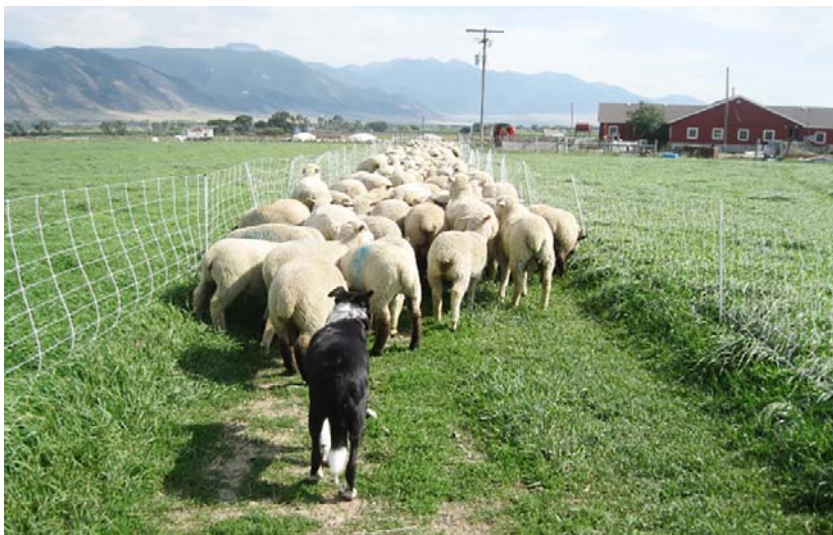
Direct marketing: you can do it.

The most important factor in marketing any food product is the quality of the product itself. A lamb producer-entrepreneur must learn how to raise, finish, and process his lamb to the degree that the finished product unquestionably demands the attention of the consumer. The lamb product