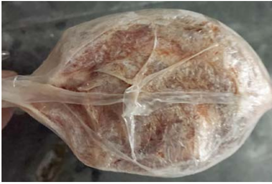
Note the capacious rib eye.