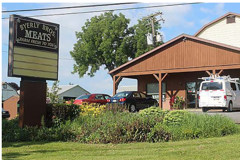
Finding a good processor is an important step in successfully marketing your lambs to the consumer. Processing your lambs at a USDA-inspected facility is necessary to market lamb across state lines.

Ideally, the processor should be relatively close to your farm. This limits the stress of hauling, allows you to easily view the hanging carcasses, and eases your transportation costs. Often, we