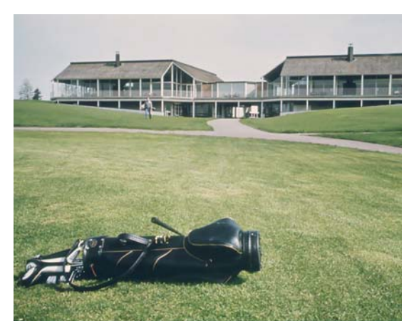
Golf course subdivisions, popular in the 1960s, were built around a clubhouse and golfing greens.

Unlike the thousands of golf-course developments in the nation, where homes are built around a central golf course and club house, an agrihood is built around a working farm, with much of the land preserved for growing food or set aside in conservation easements.