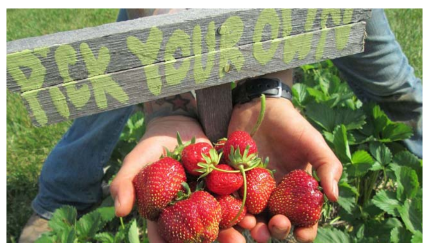
Access to local fruits and vegetables is one of the advantages of developmentsupported agriculture.

While the seemingly sudden appearance of agrihoods over the past decade across may seem to be just the latest development trend, it may in fact represent a revolutionary and permanent change in new home subdivision design. Daron Joffe, a farm-centered development consultant offered this observation: "We should have farms integrated into our communities in perpetuity—that's sustainability. That's keeping people connected to place, to food, to land, and each other. It's just a good idea." (McColl, 2015)