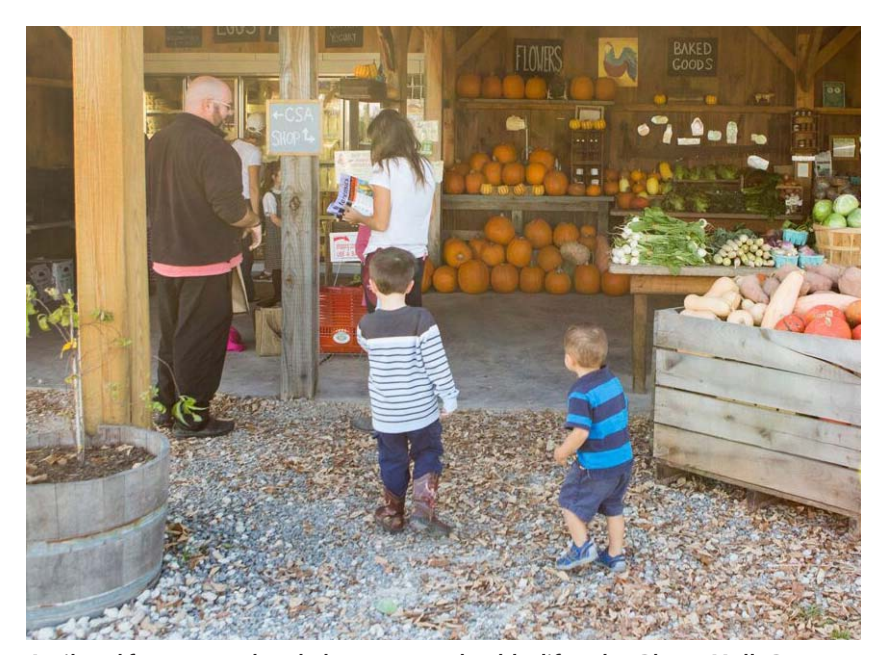
Agrihood farmers markets help encourage healthy lifestyles.

While a traditional rural development often has only one home for every 10 or even 20 acres, an agrihood typically has a much denser housing component, which can keep a much larger portion of land in agriculture or green space than an unplanned subdivision might use. And new agricultural preservation policies at the city and county level are becoming increasingly common across the United States. These new zoning approaches can help direct developers to preserve open land and farm operations in agrihoods.