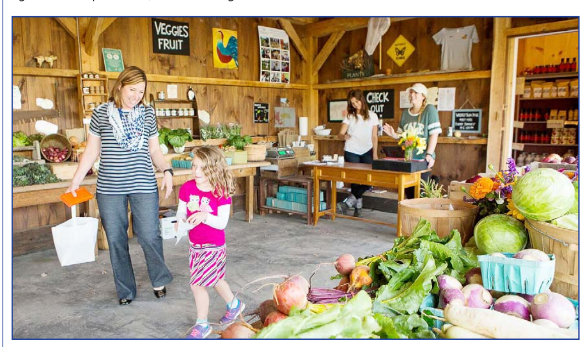
Farmers Market at Willowsford Farms.

This publication introduces the concept of development-supported agriculture , also known as agrihoods. The recent growth of agrihoods in the United States is discussed. The major types of agrihoods are described, and the benefits and challenges of agrihood development are discussed. Case studies of agrihoods are presented, and further agrihood resources are included.