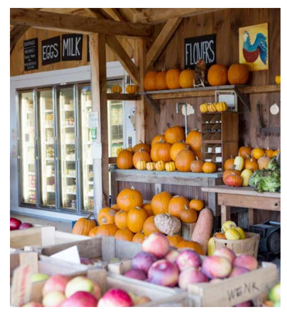
Farmers market at Willowsford Farms.