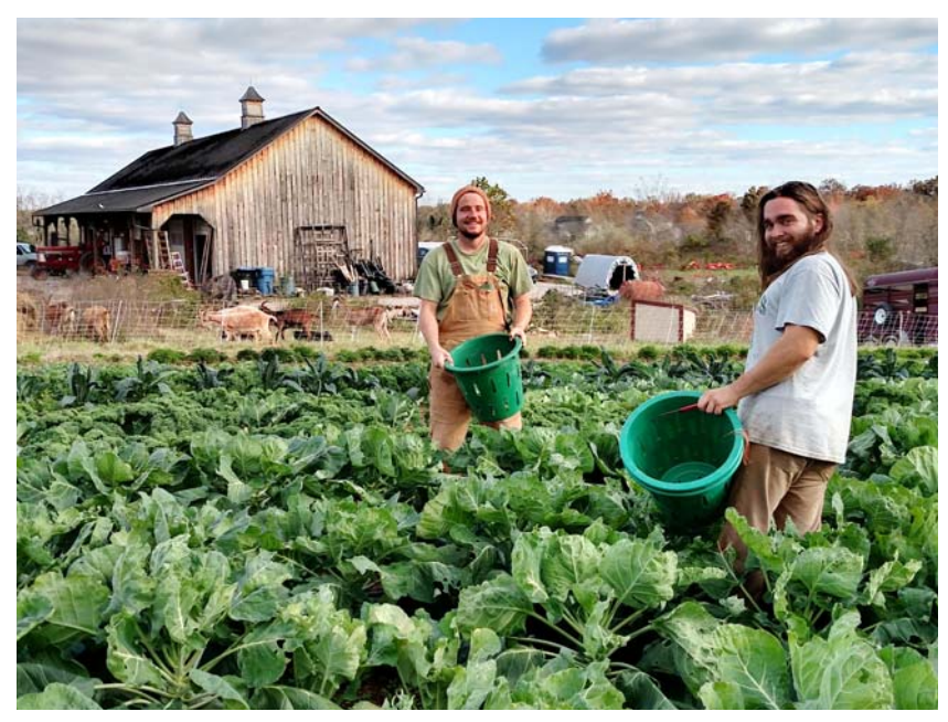
Farmers harvesting vegetables at Willowsford Farm.