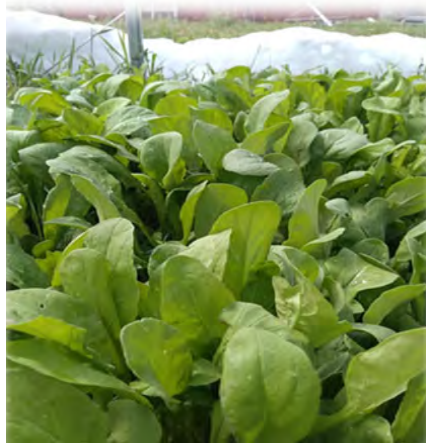
Spinach growing in early June that was protected from a late snowstorm by the high tunnel.