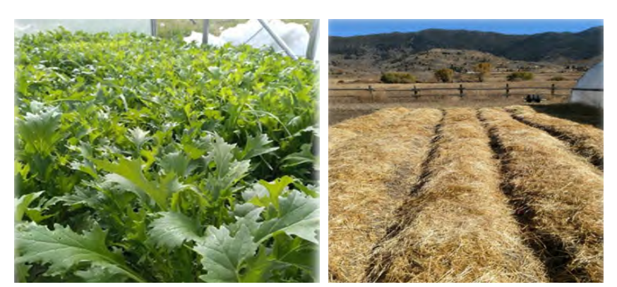
A bed of Mizuna mustard greens, ready to be harvested, and garlic beds that have been well mulched with straw to hold in moisture.

One of the SIFT farm's goals this year was to increase pollinator habitat. One way we have accomplished this is by increasing the cover cropping on the farm. The addition of more growing space allowed us to include one more cover crop in the outdoor crop rotation. These cover crops include pollinator species such as phacelia and hairy vetch. The phacelia brings a long-lasting bloom that is a haven for bees, while the hairy vetch simultaneously attracts insects and fixes nitrogen. We are also using buffer crops, which are grown in between our outdoor blocks.