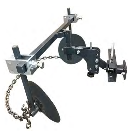
BCS bed-shaper attachment.