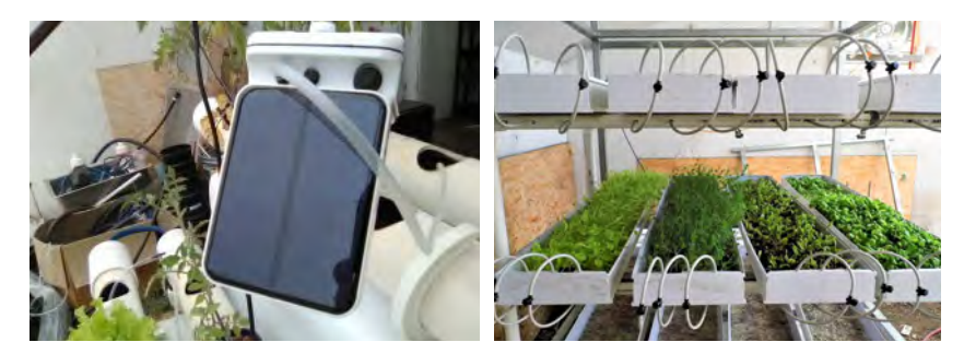
Small solar-powered air pump, left, and four trays of micro-greens, right.

is measured), the lower the concentration of sugars, proteins, and carbohydrates within the solution, so the lower the Brix score. To illustrate this, take a tomato off the vine and allow it to dry on a shelf for a few hours, then Brix test it against a tomato still on the vine (especially if the plant has just been watered). Assuming that they both had identical levels of sugar, carbohydrate, and protein to start with, the dried tomato should produce the higher Brix score. This is not because it is more nutritious than its counterpart on the vine, but because it now has a lower moisture (water) content, and therefore the sugars, carbohydrates, and proteins are more concentrated in the solution. Brix readings measure nutrient concentration. Consequently, a Brix test is not a definitive measure of the nutritional value of one fruit over another, but for our purposes (and assuming that the moisture content was similar between the hydroponically grown sample and the soil-grown sample), it was