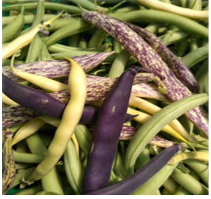
Four different varieties of bush beans grown in High Tunnel 3: Dragon's Tongue, Provider, Carson, and Romano Purpiat.

Specialty greens such as spinach, kale, mustard, arugula, and chard have always been successful spring crops at the SIFT farm, but this year's success with them highlights the importance of seeding densities and harvest schedules. All these crops can be harvested multiple times during the season if they are grown with the intent of maximizing yield. Although a dense seeding of kale can produce an excellent baby kale that is tender and flavorful, the typical technique for harvesting baby kale is to clearcut it. This technique causes the second growth to be leggy. We found that leaving more space in the seeding allows a more mature plant to develop; the mature leaves can then be selected as they become available without the kale becoming full of stems, which are not palatable. This allows for continuous harvesting throughout the season, although it means that the crop must be managed often. By getting multiple harvests off our greens using this growing technique, we exceeded our yield expectations for the year.