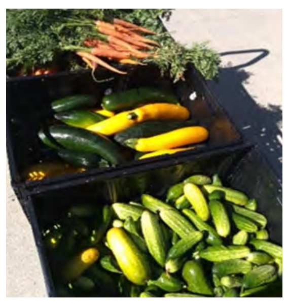
A donation to the food bank, consisting of carrots, squash, and cucumbers.

We donated smaller amounts of vegetables and specialty greens to the SNAP-Ed nutrition program. The program used these items in cooking classes, so that SNAP recipients could learn to make their food dollar go further while eating healthy.