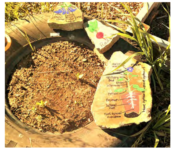
Rock art in our kids' plot demonstrates the anatomy of plants.

Continental Gardens is an assisted-living facility located adjacent to the SIFT farm. As part of an initiative to increase fresh food in schools, hospitals, and nursing homes, we packaged individual food baskets for 15 residents at the facility throughout the summer.