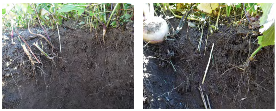
A cross-section of root growth in the North Plot cover crop, left, and root growth in the South Plot cover crop, right.