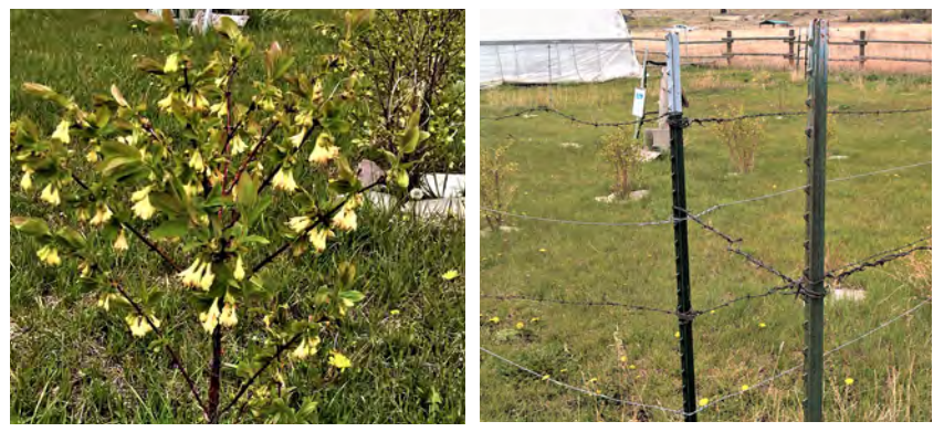
'Borealis' honeyberry flowering, left, and 3-D fencing around the fruit, right.

It is interesting to note which varieties do the best in this climate in any given year. Within the fruit tree area, the best performer this year has been the 'Borealis' honeyberry (an older variety). Meanwhile, in the native hedgerow area, Silverberries have been the most successful bushes. The important rule with fruit-producing trees and bushes is patience! Trees and bushes can sit semi-dormant for several years before the "right" season triggers dramatic growth. One only has to look at the tree rings in a sawn section of trunk to understand how little growth can occur in challenging years.