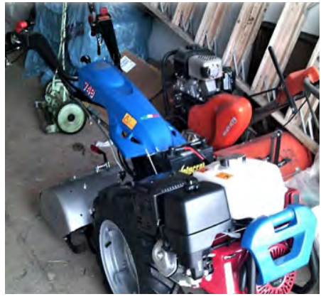
New SIFT BCS 749 with tiller attached.

The larger cavity of the Rimol high tunnel allows warm air to pool in the top, while the sides can be rolled up to vent the ground on hot days. This feature is worth noting because our main complaint about the previous high tunnels was that they did not trap enough heat or moisture to retain warmth overnight. The average indoor temperature was only one to five degrees warmer than outside, depending on the weather conditions. In our location, we occasionally have the risk of frost even on summer nights, especially on clear nights under a stagnant high atmospheric pressure. This results in a significant temperature drop at night which, coupled with a strong mountain inversion, can pull freezing air off the Continental Divide. This creates a river of cold air that snakes down from a geographical area northeast of Butte, known as Elk Park. The river