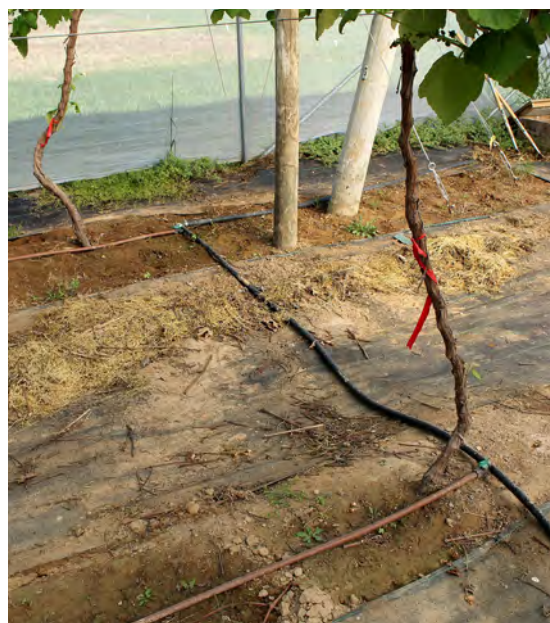
Drip tube is used for irrigation in the grape high tunnel at the Arkansas Agriculture Experiment Station.

Consistent irrigation will ensure good plant growth and fruit production and will help prevent berry splitting (Strik, 2011). The most important stages to avoid water stresses are: 1) from flowering to pea-size grapes; 2) from softening of grapes to harvest; and 3) after harvest. Water use is relatively low from leaf emergence to flowering and also in the fall as the air temperature decreases. During the ripening stage, from softening to harvest, water use is high due to increased grape size and increased transpiration due to hot temperatures. Water stress should also be avoided after harvest, so plants can build reserves for next season and grow roots (Maughan et al., 2017).