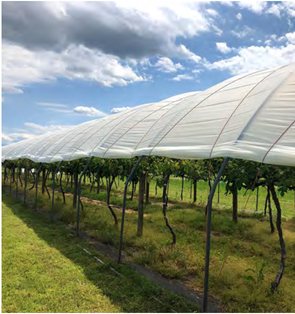
Haygrove high tunnels are ventilated by manually bunching up the plastic on each side.