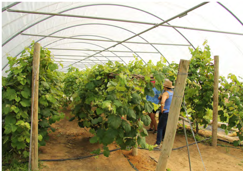
Grapevine in June in the high tunnel at the Arkansas Agriculture Experiment Station.

Magnesium deficiency is common on vines grown in acidic soils (pH lower than 5.5) or in soils containing high levels of potassium. Deficiencies usually appear late in summer as yellowing between the veins of the leaves, called interveinal chlorosis . Dolomitic limestone can be applied to correct magnesium deficiencies caused by low soil