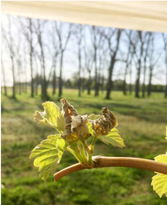
Symptoms of frost damage on young grape leaves.

can lead to a less-developed shoot or bud that will produce a partial crop. If the plant tissues in developing shoots spend just 30 minutes at 31°F or lower, significant damage can occur (Poling and Spayd, 2015). Upon thawing, shoots that have been damaged by frost will lose turgor, darken, and become water-soaked. A closed high tunnel can help reduce the risk of frost damage by trapping warm air during the day and buffering drops in night-time temperatures by a few degrees.