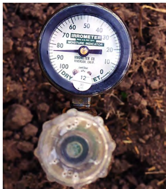
A tensiometer can be used to monitor soil moisture levels and determine when to irrigate.

Soil moisture can be measured in terms of soil water potential, which indicates how hard plant roots have to “pull” to obtain water from the soil. Tools used to measure soil water potential include tensiometers and electrical resistance blocks, such as the Watermark™ sensor manufactured by Irrrometer Co. It is recommended to monitor soil moisture at several depths, including the primary root zone (12 inches) and at a lower depth where the branched lateral roots grow (30 to 36 inches) (Maughan et al., 2017). The soil moisture should not be allowed to drop below 60% available water, which corresponds to a soil water potential of 65 to 95 centibars for a loam soil. See Table 1 for 60% depletion values for each soil texture. Water potential is inversely related to available water, so a lower number indicates more available water and a higher number indicates less available water. When the soil water potential reaches these values for your soil, it is time to irrigate.