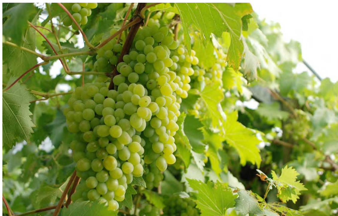
'Gratitude' grapes growing in a high tunnel at the Arkansas Agriculture Experiment Station in Fayetteville.

This publication is a deliverable of the Southern SARE Project, "High Tunnel Grape Production Systems: A Novel Sustainable Approach to Growing Grapes," in collaboration with the University of Arkansas, Arkansas Cooperative Extension, and the Arkansas Association of Grape Growers.