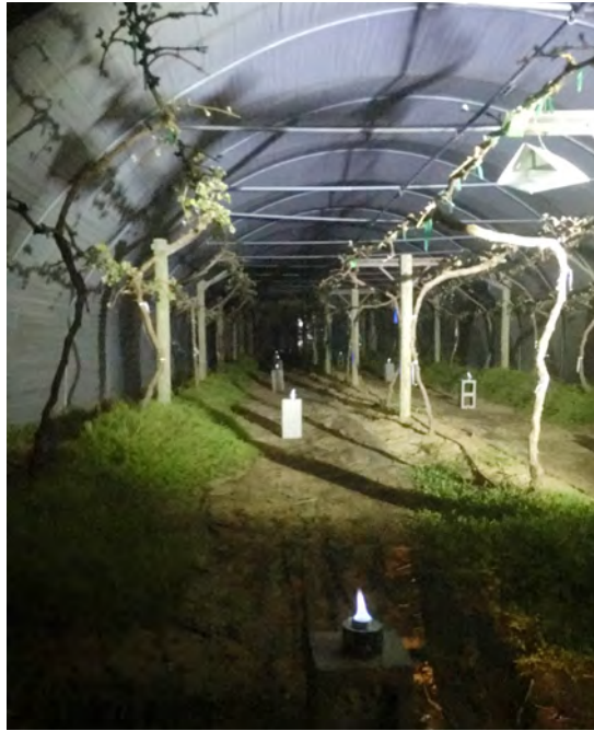
Sterno burners being used to provide supplemental heat in the grape high tunnel during a freeze event.

Temperature management is an important factor in successful high tunnel grape production. Because high tunnels modify the air temperature, growers must take care to ensure that the temperature in