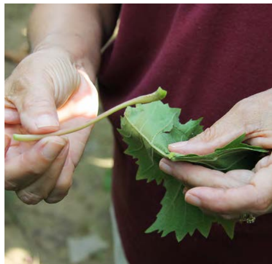
Grape leaf petioles can be sampled and tested to assess the nutrition status of the vine.

Grape leaf petioles can be tested to determine the nutrient status of the vine and assess whether sufficient fertility is being provided. Petiole sampling should be done in the spring at full