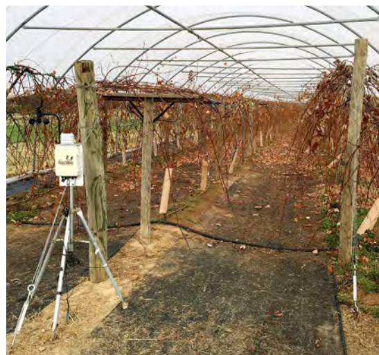
The high tunnel is kept open in the winter to allow grapevines to go dormant.

Like other perennial fruit crops, grapes require a certain amount of exposure to cold temperatures before they can break bud normally in the