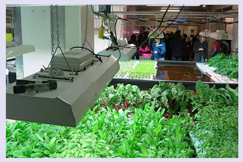
Large banks of fluorescent lamps provide the spectrum of light that keeps the floating beds of plants alive year-round in The Plant Chicago, a vertical farming facility.

But even with these reductions in lighting costs, the total electrical bill (and carbon footprint) of a self-contained vertical greenhouse can be substantial. Continued research and development of even more efficient LEDs will help reduce the costs and carbon pollution contribution of LED lighting in vertical farming operations.