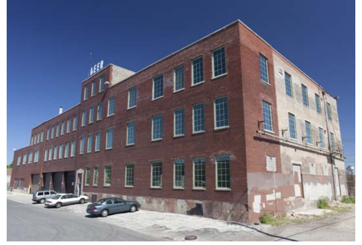
Chicago's "The Plant" vertical farm.