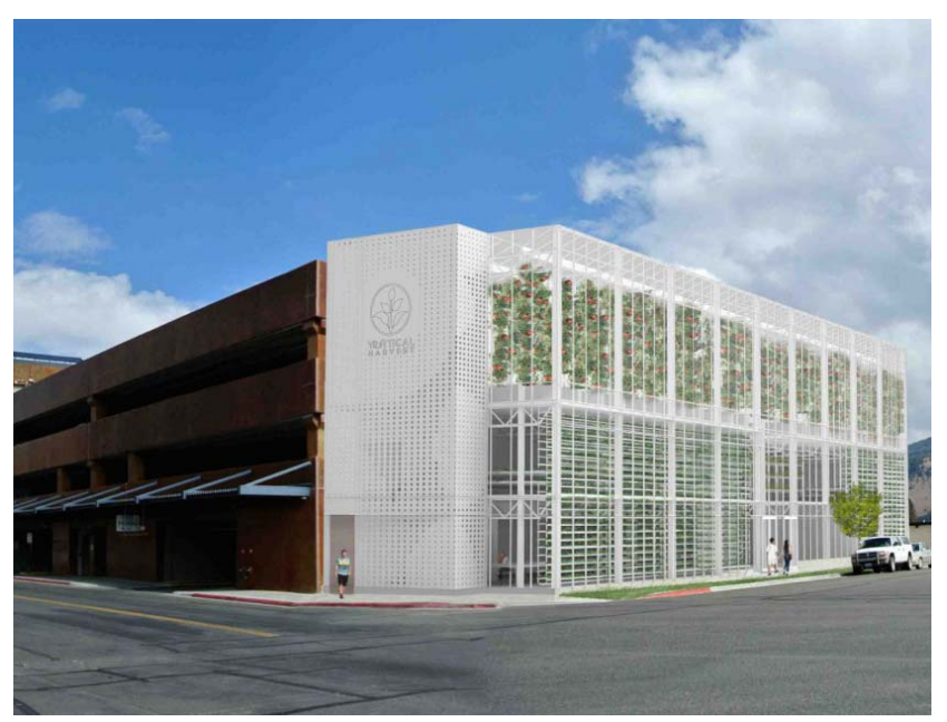
Vertical Harvest, Jackson, Wyoming.

Of this production, 95 percent is already contracted for delivery to local restaurants and consumers.