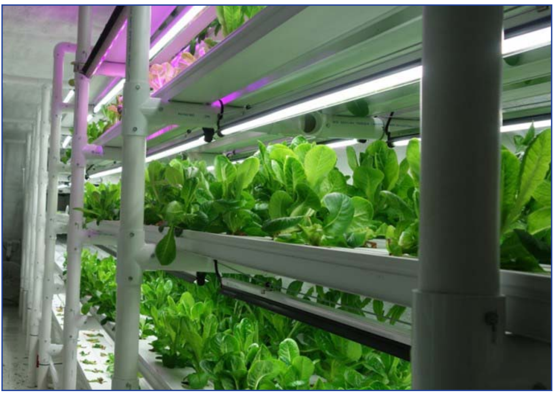
Interior view of Freight Farms' shipping-container vertical farm.

This publication introduces commercial-scale vertical farming and discusses the recent growth of vertical farms in urban areas. It describes the major types of vertical farms and discusses environmental issues with vertical farms. The publication includes a list of the major vertical farms in the United States and lists further resources.