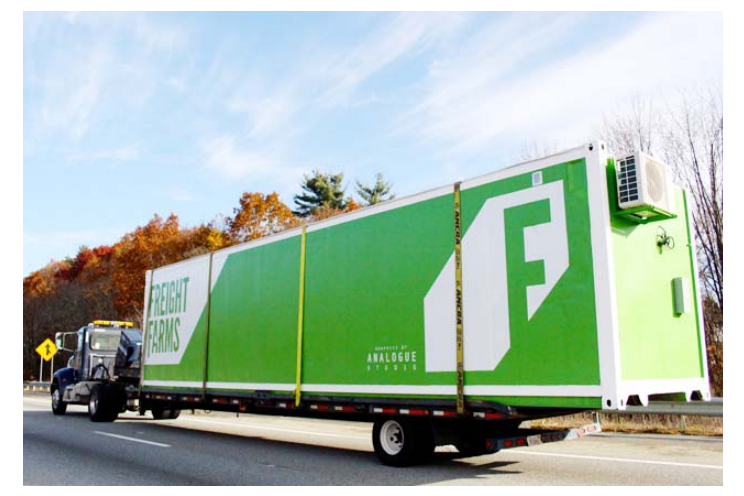
Exterior view of Freight Farms' shipping-container vertical farm.