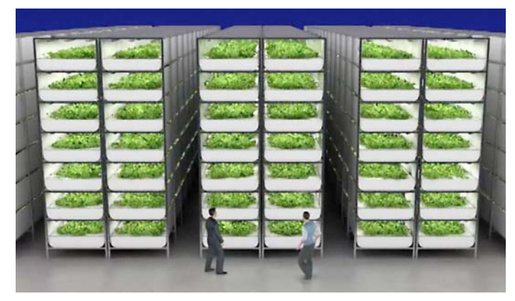
A mockup of a growing room at the new site.

"We're 75 times more productive per square foot annually than the field, and even ten times more productive than a