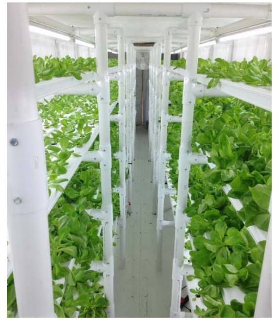
Interior view of Freight Farms' shipping-container vertical farm.

Shipping-container vertical farms are an increasingly popular option. These vertical farms use 40-foot shipping containers, normally in service carrying goods around the world. Shipping containers are being refurbished by several companies into self-contained vertical farms, complete with LED lights, drip-irrigation systems, and vertically stacked shelves for starting and growing a variety of plants. These self-contained units have computercontrolled growth management systems that allow users to monitor all systems remotely from a smart phone or computer. Three of the leading companies producing shipping-container vertical farms are Freight Farms, CropBox, and Growtainers (See Case Study 3, page 11).