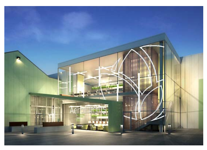
A mockup of the new vertical farm in Newark.

hydroponic greenhouse," he says. "We use over 95 percent less water than growing out in the field."