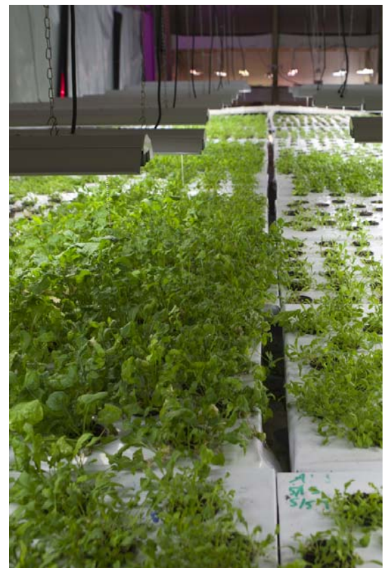
Interior view of Chicago's "The Plant" vertical farm.

Building-based vertical farms are often housed in abandoned buildings in cities, such as Chicago's "The Plant" vertical farm that was constructed in an old pork-packing plant. New building construction is also used in vertical farms, such as the new multistory vertical farm being attached to an existing parking lot structure in downtown Jackson Hole, Wyoming (see Case Study 2, page 10).