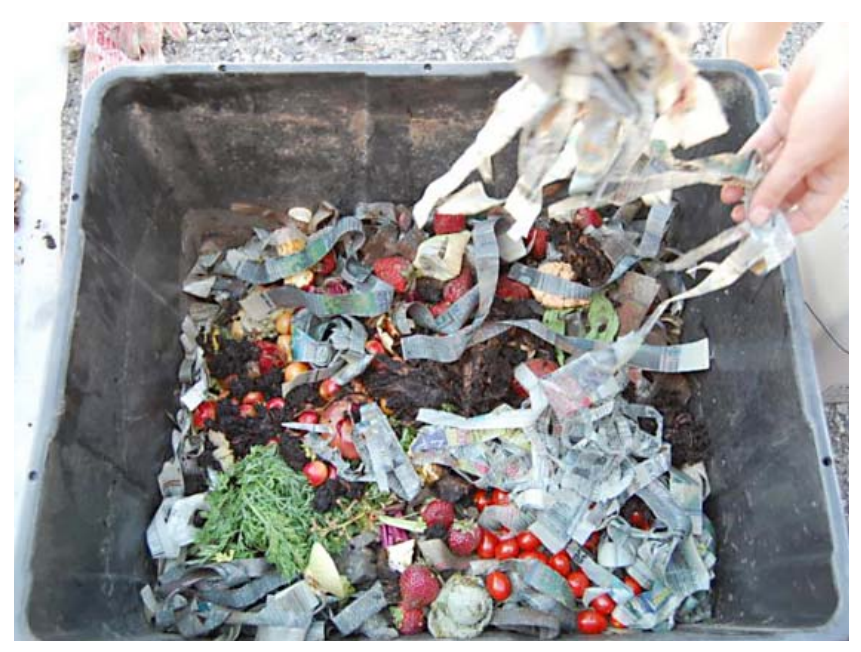
Produce nearing the end of its shelf life makes great worm feed.

It's helpful to refer to the brown, carbon-laden, materials in your bin as the bedding. The green, nitrogen-rich, material is the food.