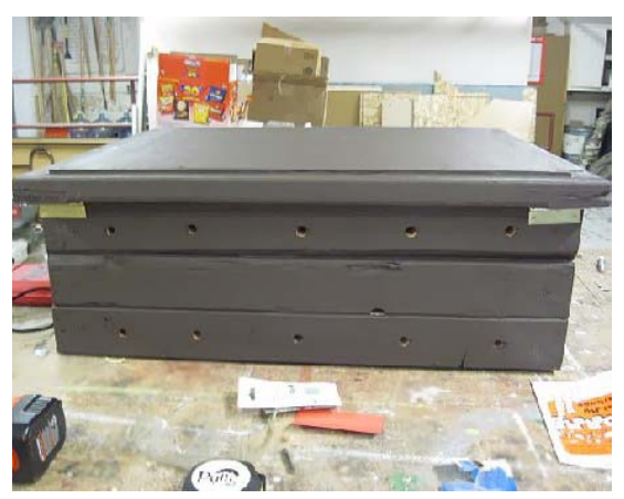
The completed worm bin.

the house. Some experts recommend wooden vermicompost bins because they are more absorbent, better insulated, and provide better air flow (Dickerson, 2001). But it certainly is possible to build successful plastic bins, and many people do.