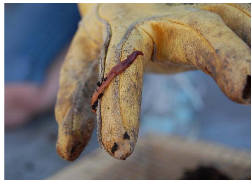
An Eisenia fetida worm, commonly known as a red worm.

The kinds of worms you're likely more familiar with, such as common garden worms, don't work well for vermicomposting because they aren't capable of breaking down high levels of organic matter. But even though you can't just go out in