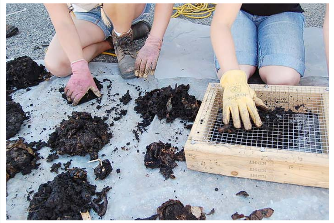
Worm castings are hand-sorted and fresh vermicompost is screened.

Composting is a matter of getting just the right combination of "brown" materials high in carbon, such as straw, paper, etc., with "green" materials that are high in nitrogen, such as plants. Then, basically, you let them decay. Micro-organisms and some macro-organisms - such as worms -