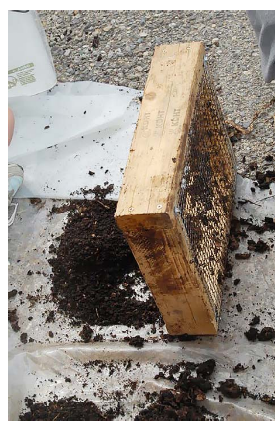
Fresh vermicompost is ready to add to soil after it has been hand sorted and screened.

You will need somewhere to place the worms; perhaps replace the bedding in the bin and put them there. Once again, any bedding that isn't broken down can be placed back in the bin.