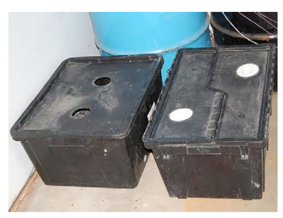
Modified plastic containers make great worm bins.

The lid needs to be tight-fitting to help regulate the temperature inside the bin and to keep light from penetrating the bedding and getting to the worms. Worms and light don't mix. An hour in sunlight will paralyze a worm and just a few hours of sunlight can kill it. Besides, you