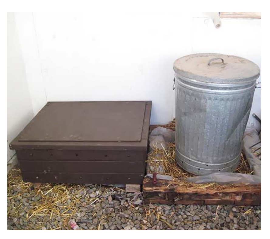
A vermicompost bin is placed in a greenhouse next to a trashcan composter.

Wherever you place your bin, be sure to monitor its temperature to make sure the environment inside is good for your worms.