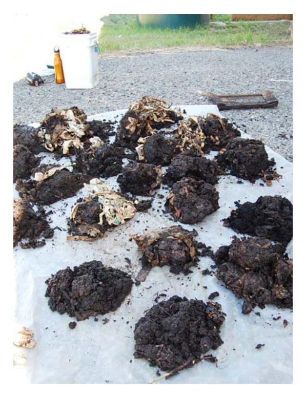
Worm bin castings have been removed from a worm bin and placed into piles that are ready to be separated out into vermicompost. Notice that the piles have been placed on a plastic sheet and are being kept out of direct sunlight.

Once all the worms have been separated from the castings, remember that any bedding that didn't break down can be used in your bin again.