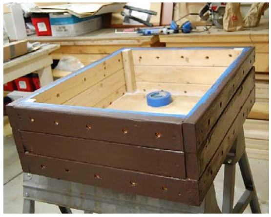
A wooden worm bin is being built.

Another popular option is to make bins from opaque plastic storage containers. It's an easier process than building a wooden container, and people often have spare containers around