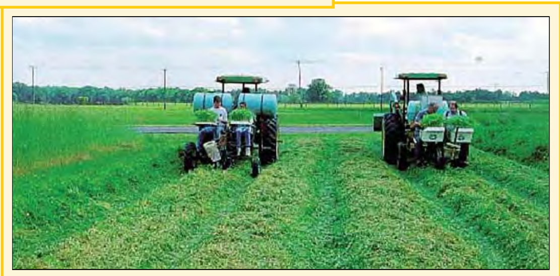
Figure 3. Transplanting tomatoes into mechanically killed hairy vetch. (From USDA Farmer's Bulletin No. 2279).

Water consumption by green manure crops is a concern and is pronounced in areas with less than 30 inches of precipitation per year. Still, even in the fallow regions of the Great Plains and Pacific North-