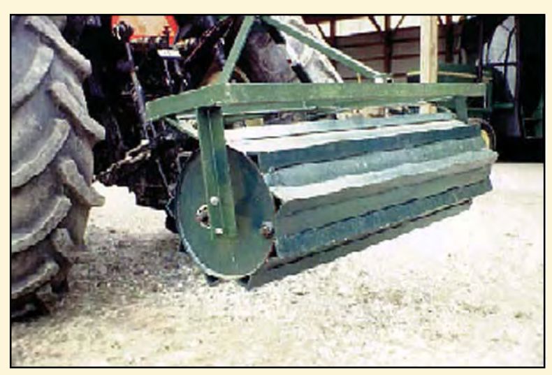
Figure 2. A homemade roller to kill cover crops (From USDA Farmer's Bulletin No. 2279).

The recognized benefits of green manuring and cover cropping—soil cover, improved soil structure, nitrogen from legumes—need to be evaluated in terms of cash returns to the farm as well as the long-term value of sustained soil health. For the immediate growing season, seed and establishment costs need to be weighed against reduced nitrogen fertilizer requirements and the effect on cash crop yields.