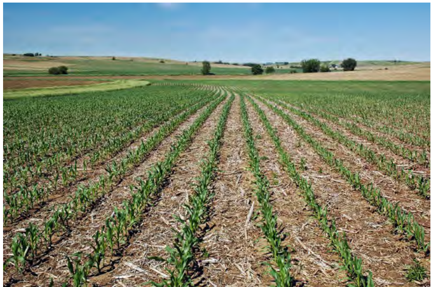
Images show erosion in an uncovered field versus a field that uses no-till methods and cover crops.

protection zones. Regulating services can be provided and improved in multiple ways by farmers practicing sustainable and regenerative methods. The most notable regulating services are water-quality protection, conservation of water quantity, and nutrient cycling. These are facilitated through enhanced water infiltration and water-holding capacity and through microbial processes that enhance soil tilth and nutrient holding.