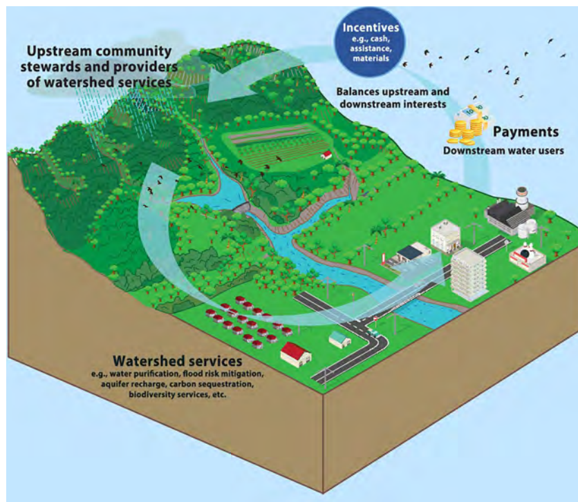
Source: “Charting New Waters: State of Watershed Payments 2012,” Bennett et al., 2013

Farmers may also participate by reducing greenhouse gases, including methane and nitrous